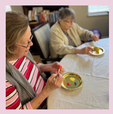
At Crafters' Corner, we painted our very own Easter egg creations. It was a great time of laughter and reminiscing about past Easter celebrations.